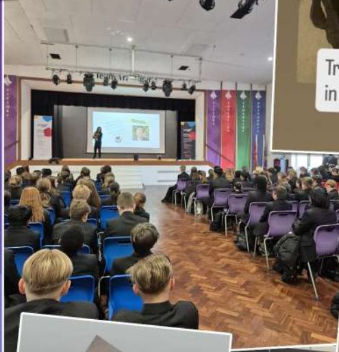
Trafalgar Alumni students coming in today to talk about 'Life Beyond Trafalgar'!