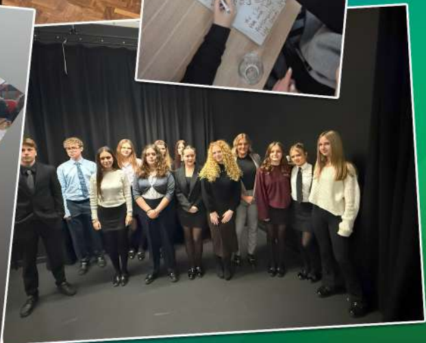
Year 11 taking part in their 'Aim Higher' workshops today